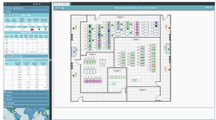
Colocation Room – Data Center separated into zones for each tenant.

Nlyte Energy Optimizer was the first DCIM solution to offer features specifically for co-location facilities. With these features, including tenant-specific information availability and real-time heat mapping with a dynamic thermograph, large co-location facilities can make efficiency changes and still keep tenants happy.